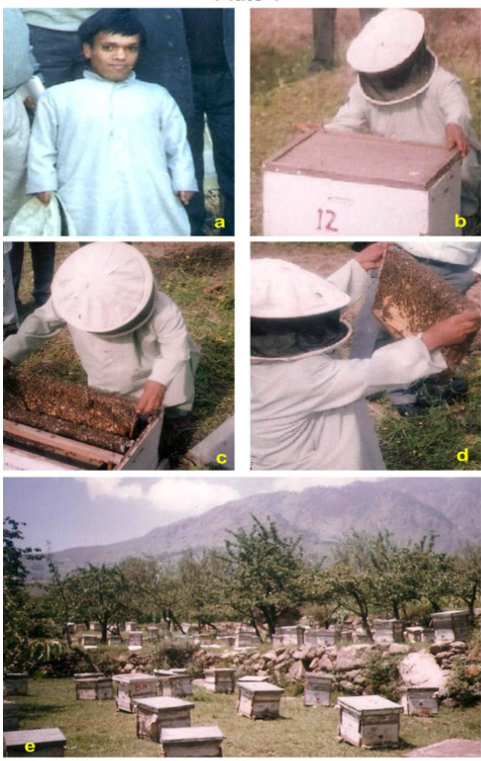
Plate 1. a) A tiny beekeeper; b, c and d) working with bees and; e) Apiary maintained by tiny beekeeper