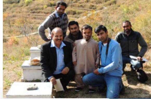
Interacting with scientists of KVK, Bhaderwah