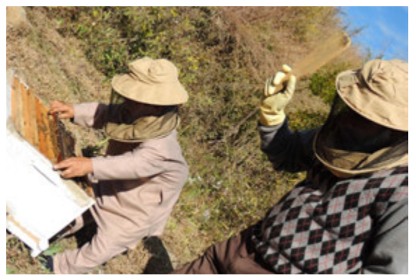
Inspecting the bee hive